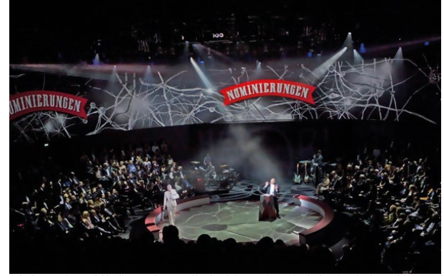
Photo courtesy of Studio Hamburg – the back image is projected onto Black HATOScreen.